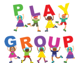
PLAYGROUP THIS FRIDAY