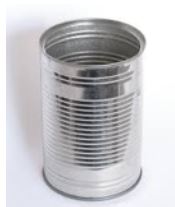
CAN YOU HELP? YES YOU CAN