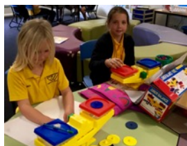
MEASURING UP MATHS @ WELTON