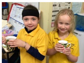
FAST BREAK WELTON TUCKS INTO BREKKY