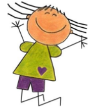
STUDENT FREE DAY NO SCHOOL ON JUNE 10