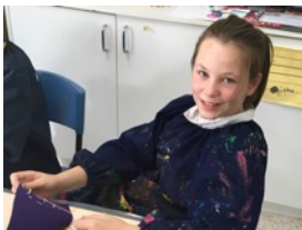
SEW WHAT! WELTON KIDDIES THREAD THE NEEDLE