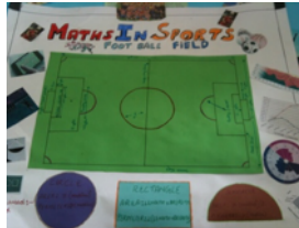
MATHS IN SPORT GO FIGURE