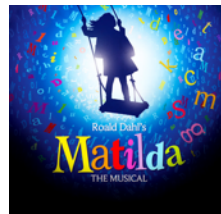
COMING SOON WE'VE GOT TICKETS