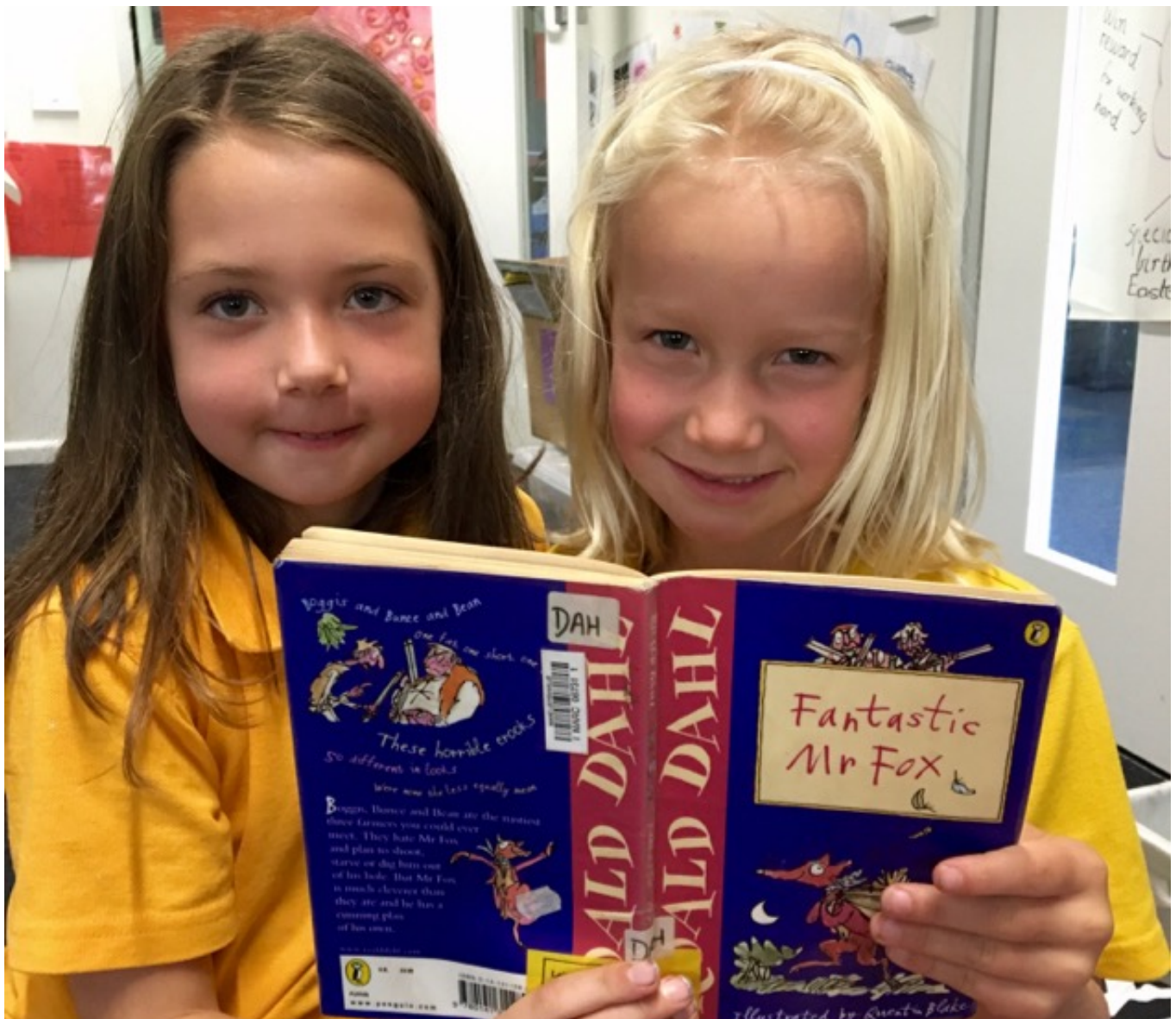
This term we are studying the works of Roald Dahl.