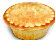
PIE DRIVE START YOUR ENGINES