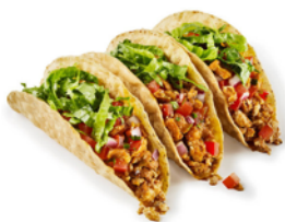
TUCK IN TO A TACO AT GUNBOWER