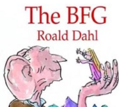
DAHL-ICIOUS DAY FRIDAY 24 JUNE