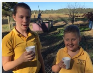
OUTDOOR ED FUN