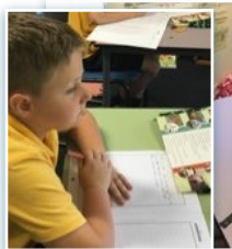
NAPLAN IS OVER