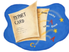
MID YEAR REPORTS