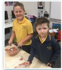
ON A ROLL